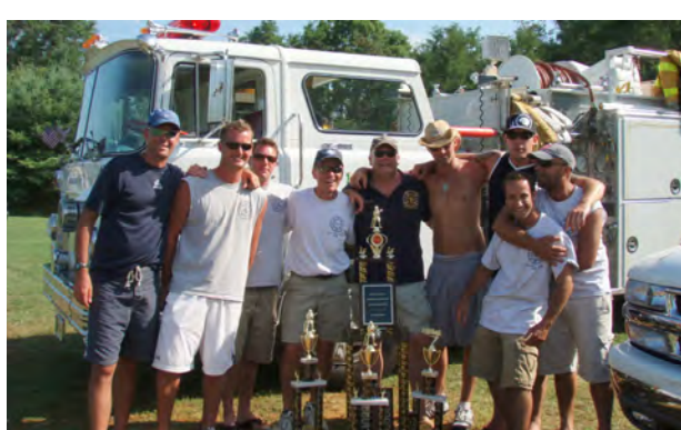
Go to http://www.fhfd.org/photovideogallery.html for exciting video of the prize winning performance.

These victories reflect many hours of practice, as well as skills that are put to use in case of an actual structure fire.